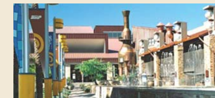
Chandler Fashion Center Dec. 5 | $19 | Depart 9am | Return 3pm

Book a tour early. Without enough bookings, RCSC must cancel tours.