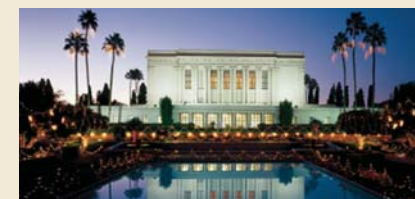
Dinner at Monti's La Casa Vieja/ Lights at Mormon Temple Dec. 20 | $85 | Depart 4:45pm | Return 9:30pm

This is something new for the holidays and we are excited to have you join us for this display of lights in the valley. We will begin with an old fashion festive dinner at one of our favorite restaurants in metro Phoenix, "Durant's." Upon arrival you will have a choice of selection off the holiday menu. Following dinner, we'll see the light display at the following - the famous Biltmore area, JW Marriott, Kierland Commons, Westin Hotel, Church of Joy and the Wigwam Resort. There is very little walking on this tour and it has been specially designed for anyone to come along! Please wear casual clothes and comfortable walking shoes.