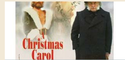
"A Christmas Carol" at Broadway Palm Dinner Theatre Dec. 7 | $89 | Depart 10:45am | Return 5pm

The first stop will be for dinner at the historic Monti's La Casa Vieja located in Tempe, Arizona, is the city's original pioneer home and the oldest continuously occupied structure in Phoenix metropolitan area. Choices for dinner are 6oz Filet Mignon, French Cut Chicken with a spinach & mushroom cream sauce or Seabass in a white wine reduction & Apple Chayote Relish. Following dinner, we'll visit The Mormon Temple beautifully lit with more than 500,000 multi-colored lights just for the Christmas Holidays. This is a walking tour, so you will need to dress warmly as the desert evenings can be chilly. From the Temple, we'll continue our journey to view private homes with holiday lights along the way back to the West Valley.