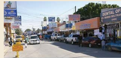
Algodones, Mexico Dec. 13 | $60 | Depart 7am | Return 8:30pm

Based on Charles Dickens's story, this production is the Broadway version of the classic Christmas tale. Grumpy old Ebenezer Scrooge gets a visit on Christmas Eve from three spirits hoping to change his outlook on life in general. Bring in the spirit of Christmas with us at Broadway Palm Dinner Theatre in Mesa!