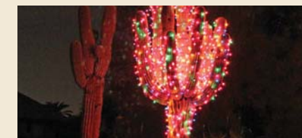
Dinner at Durant's and Christmas lights in Metro Phx Dec. 15 | $95 | Depart 3pm | Return 7:30pm

Direct from Broadway, the classic holiday movie White Christmas comes to the stage at last! This brand-new musical shines with classic Berlin hits like "Blue Skies," "How Deep is the Ocean?" and, of course, the unforgettable title song. Irving Berlin's White Christmas tells the story of two buddies putting on a show in a magical Vermont inn and finding their perfect mates in the process. Full of dancing, laughter and some of the greatest songs ever written, Irving Berlin's White Christmas promises a merry and bright theatrical experience for the whole family. Excellent seating for attendees in rows 12-17.