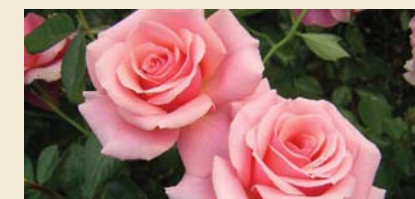
2012 Tournament of Roses: Just Imagine Dec. 31-Jan. 3 | $759 double / $999 single | Depart 7:15am | Return 7pm

What a great way to spend Christmas and tour includes: 4-days / 3-nights at the Embassy Suites by the Bay, dinner at Anthony's, breakfast daily, Christmas dinner on board with The Hornblower Cruise Lines, Mission Tour of San Juan Capistrano, Trolley tour of the Bay area, roundtrip transportation, professional guide, snacks and water, including guide and driver gratuities.