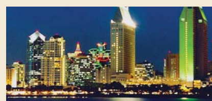
Christmas in San Diego Dec. 23-26 | $799 double/$1,085 single | Depart 7:15am | Return 7pm

Enjoy a cultural change in this Mexican border town across from Yuma. Residents can have their eyes or teeth examined and prescriptions can be filled. PASS-PORTS REQUIRED. It is the responsibility of each resident to know the laws regarding crossing the border, identification requirements and making any purchases. There are plenty of shopping bargains. Food not included and don't forget your own bottled water. Tour includes round-trip transportation and tour guide.