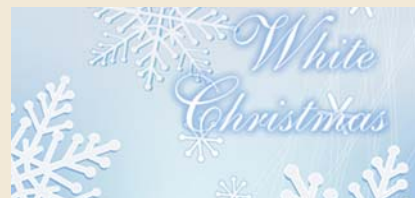
"White Christmas" at last comes to stage at Gammage Dec. 7 | $83 | Depart 6:15pm | Return 11pm

Comprised of 180 shops and restaurants, the indoor/outdoor Mall is anchored by Dillard's, Macy's Nordstrom and Sears and boasts a plethora of upscale shopping favorites including Apple Store, Coach, Sephora, Williams-Sonoma, Pottery Barn, Electric Ladyland, L'Occitane, bebe, Arden B. and Bailey, Banks & Biddle to name a few. Enjoy an extensive selection of restaurants and eateries including Kona Grill, The Cheesecake Factory, California Pizza Kitchen, BJ's Restaurant & Brewery and Gardunos. Attendees will be welcomed by a concierge distributing mall maps and store coupons. Don't forget to see the largest water fall of its kind in any U.S. shopping center. Lunch not included, but available from vendors.