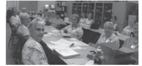
Our members meet to discuss preparing for the upcoming Arts & Crafts Festival.