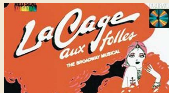
La Cage Aux Folles at Gammage

Book a tour early. Without enough bookings, RCSC must cancel tours.