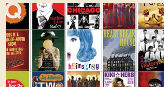
Broadway's "Best Musicals" at Herberger Theater

Come see the World Series Champion St. Louis Cardinals at Chase Field battle against your Arizona Diamondbacks. Enjoy the sights and sounds of this afternoon game! Food is available from vendors, but not included. All seating is located in the lower level, Section 111.