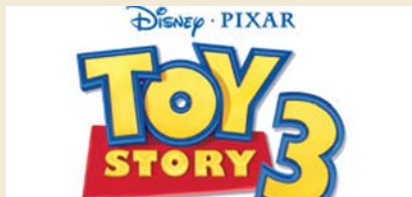
Disney on Ice presents "Toy Story 3" at US Airways Center Jan. 20 | $45 | Depart 9:30am | Return 3pm

Enjoy a cultural change in this Mexican border town across from Yuma. Residents can have their eyes or teeth examined and prescriptions can be filled. PASS-PORTS REQUIRED. It is the responsibility of each resident to know the laws regarding crossing the border, identification requirements and making any purchases. There are plenty of shopping bargains. Food not included and don't forget your own bottled water. Tour includes round-trip transportation and tour guide.