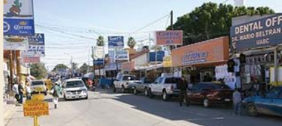
Algodones, Mexico Jan. 10 | $60 | Depart 7am | Return 8:30pm

Enjoy a cultural change in this Mexican border town across from Yuma. Residents can have their eyes or teeth examined and prescriptions can be filled. PASS-PORTS REQUIRED. It is the responsibility of each resident to know the laws regarding crossing the border, identification requirements and making any purchases. There are plenty of shopping bargains. Food not included and don't forget your own bottled water. Tour includes round-trip transportation and tour guide.