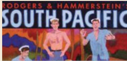
Rogers & Hammerstein's "South Pacific" at Gammage Jan. 15 | $115 | Depart 11:15am | Return 4pm

Book a tour early. Without enough bookings, RCSC must cancel tours.