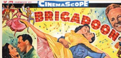
"Brigadoon" at Broadway Palm Dinner Theater Jan. 26 | $89 | Depart 10:45am | Return 5pm

This breathtaking new production of South Pacific is based on the 2008 Tony Award Lincoln Center Theater production, directed by Bartlett Sher. Set on a tropical island during WWII, the musical tells the sweeping romantic story of two couples and how their happiness is threatened by the realities of war and their own prejudices. The beloved score's songs include "Some Enchanted Evening," "I'm Gonna Wash That Man Right Outta My Hair," "This Nearly Was Mine" and "There Is Nothin' Like A Dame." USA Today cheers, 4-Stars, Gorgeous! South Pacific doesn't just float; it soars!