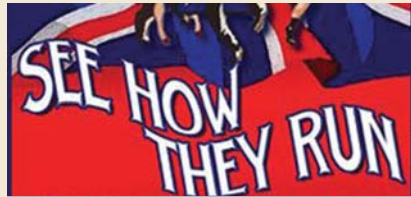
"See How They Run" at Hale Centre Theatre in Gilbert Jan. 14 | $75 | Depart 1:15pm | Return 7pm

Catch all the heroic action when Buzz Lightyear, Woody, Jessie and the Toy Story gang escape from the rambunctious tots of Sunnyside Daycare and race for home in their most daring adventure ever. A few new faces join the fun including Barbie's groovy bachelor Ken and Lots-o'-Huggin' Bear. It's the biggest Toy Story experience on ice, jam-packed with fast-paced adventure such as Buzz's galactic battle with Emperor Zurg and a hoe-down at Woody's Roundup. Rediscover the humor, friendship and charm of Toy Story when Disney on Ice presents Disney Pixar's Toy Story 3 takes family fun to infinity and beyond. Afterward, we'll have lunch at the Country Buffet where there is something for everyone!