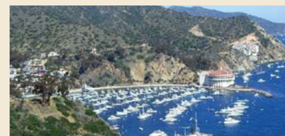
Catalina Island/Flower Fields/Joshua Tree National Park

Sabino Canyon Tour offers a narrated, educational tour into the foothills of Santa Catalina Mountains. During our 45 minute narrated tram tour you will experience breathtaking views of the canyon and cottonwoods lining the creek beds below. Lunch will be on your own before our docent tour of "DeGrazia Gallery in the Sun." There are six permanent collections of paintings that trace historical events and native cultures of the Southwest. You will see the various types and styles of oils, watercolors, lithographs, sculptures, ceramics and jewelry. Come and soak up a little Southwest culture!