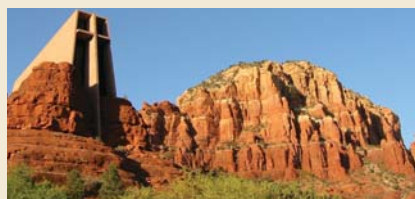
Sedona: The Land of the Red Rocks

Tour Includes: 6-days / 5-night hotel accommodations with 3-nights at Wonder Valley Ranch Resort and 2-nights at Embassy Suites (Seaside, CA), Roundtrip Airfare, Sequoia and Kings Canyon National Park Blossom trail, Winchester Mansion Tour, 17 mile drive (Pebble Beach and Camel), 1-brunch, 4 breakfasts, 3 lunches and 3 dinners, motor-coach transportation throughout the tour, door to door transportation from home to Sky Harbor Airport, baggage handling, professional guided tour, taxes, driver and guide gratuities. California's weather is quite a bit cooler than Arizona. March is generally in the lower 60's with lows in the 50's. Be sure to bring a light jacket or sweater with comfortable walking shoes and casual clothing.