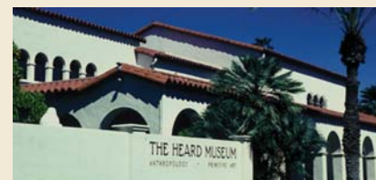
Tour the Heard Museum

Book a tour early. Without enough bookings, RCSC must cancel tours.