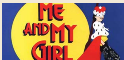
Broadway Palm Dinner Theater presents "Me and My Girl"

Often called "Red Rock Country," Sedona is a four seasons playground for everyone whether you're into culture; power shopping; spiritual and metaphysical, this is a backdrop of some of the most spectacular scenery in the world. Upon arrival in Sedona we will have a brief stop at the "local" airport where the surrounding views are perfect for a photo opportunity. Lunch on your own at a local restaurant with time to shop and browse the many wonderful shops, art galleries and boutiques. Natural endowments aside, you'll find world-class hotels, resorts, bed and breakfasts. Escape the chaos of life, kick back, relax and just be in Sedona. On our return trip we will stop for dessert (included) at Rock Spring Café.