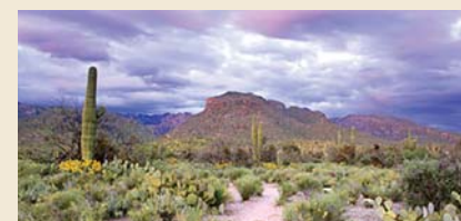
Sabino Canyon & Degrazia Art Gallery

Come along and experience the living cultures of Native people in the 21st century with the Heard Museum's signature exhibition. More than 2,000 objects tell the many stories of "home" for Southwestern Native peoples from ancestral time to today. The exhibit includes the finest work from the Heard Museum's permanent collection and reflects the importance of family, community, land and languages-commonalities that play an important role in the lives of all American Indians.