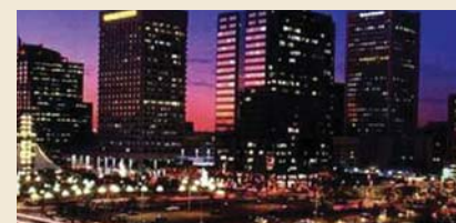
Valley of the Sun Tour

It's 1937 and the Earl of Hareford has died leaving no apparent heir. The family has gathered, eagerly waiting to hear how the estate will be split. The unlikely heir is commoner, Bill Snibson, a pugnacious Cockney ne'er-do-well from Lambeth. Hilarity ensues as the Duchess tries to turn Bill into a proper gentleman. The British blue-bloods eventually warm to his charm and so will you as you dance in the aisles to the "Lambeth Walk!"