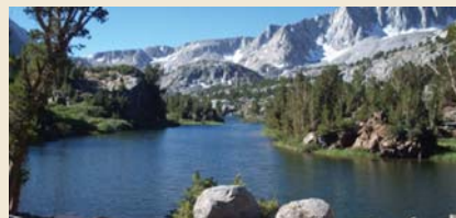
Sequoia/Kings Canyon National Park/Monterey, Calif.

March 4-9 | $1,700 double/$2,300 single | Depart TBA | Return 9pm