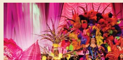
Palm Spring Follies in Palm Springs, Calif.

Tour includes stops in: Phoenix, Scottsdale and Tempe. This entertaining, educational and interesting tour includes facts about the past and present of the Metropolitan Phoenix area. Lunch is on your own at the many restaurants to choose from in Old Town Scottsdale.