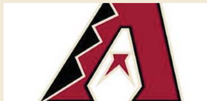
Diamondbacks vs. Giants

Book a tour early. Without enough bookings, RCSC must cancel tours.