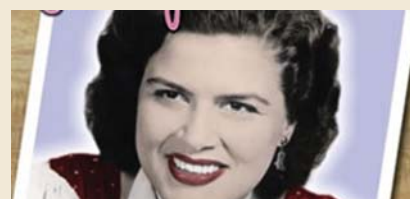
A Closer Walk with Patsy Cline at Broadway Palm Dinner Theatre

Come see the talented Philadelphia Phillies at Chase Field battle against your Arizona Diamondbacks! Enjoy the sights and sounds of the game starting at 6:40pm. Food is available from vendors, but not included.