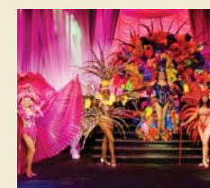
Palm Spring Follies in Palm Springs, Calif.

March 22-24 | $330 double/$460 single | Depart 8am | Return 4pm