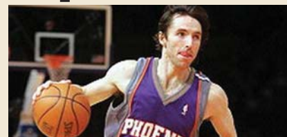
Phoenix Suns vs. New Orleans

April 1 | $45 | Depart 4:45pm | Return 10pm