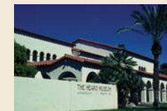
Tour the Heard Museum

March 13 | $56 | Depart 8:30am | Return 12:30pm