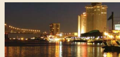
New Orleans in April

Come see the division rival San Francisco Giants at Chase Field battle against your Arizona Diamondbacks. Enjoy the sights and sounds of this afternoon game! Food is available from vendors, but not included.