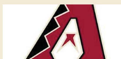
Diamondbacks vs. Phillies

Discover the Heritage of the South. Join in the fun and excitement of Cajun food and Southern hospitality, add in the French Quarter, Oak Valley Plantation, mix in the New World War II Museum, a River Cruise and the New Orleans School of Cooking, sprinkle with the French Market and top off with dinner at the famous Brennan's Restaurant! You now have the perfect recipe for touring New Orleans! Tour includes: roundtrip airfare (non-stop flight), door to door transportation from your home to and from the Sky Harbor Airport, 5 days and 4 nights hotel accommodations at the Embassy Suites, New Orleans, city tour, visit the French Market, visit of the New Orleans School of Cooking, World War II Museum, a Riverboat Cruise, tour with Lunch at Oak Alley Plantation, Dinner at Brennan's, breakfast daily, complimentary cocktails nightly, a professional guided tour, baggage handling, motor coach transportation while in New Orleans, driver & guide gratuities and all taxes.