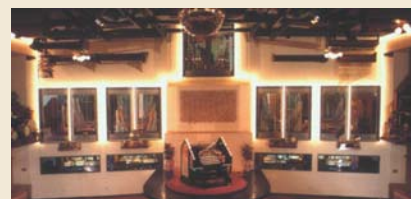
Organ Stop Pizza - Everybody's Favorite

Do you scrapbook? Make cards? Create home décor items? Join us at the Mesa Convention Center for the Creating Keepsakes Convention. You'll have the opportunity to shop at exhibitors' booths such as IT!, The Button Farm, Lickety Split Scrapbooks, Keller's Creations, SEI, The Paper Loft, Craft Fantastic, Strictly Scrapbooking and many more. You'll find booths that carry the latest products as well as those with incredible deals. The Creating Keepsakes Convention - Mesa Vendor Faire is a one-stop shopping location that has scrap-bookers and paper crafters coming from all over the Valley to enjoy. The convention offers something for everyone, so grab a friend or two and join the fun! Lunch is on your own.