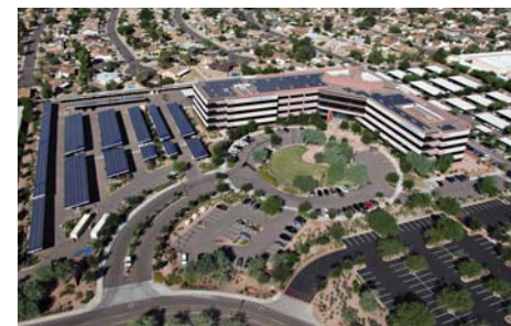
An example of what RCSC's new solar electric systems will look like.

Because RCSC is a non-profit organization it is not eligible for the federal tax