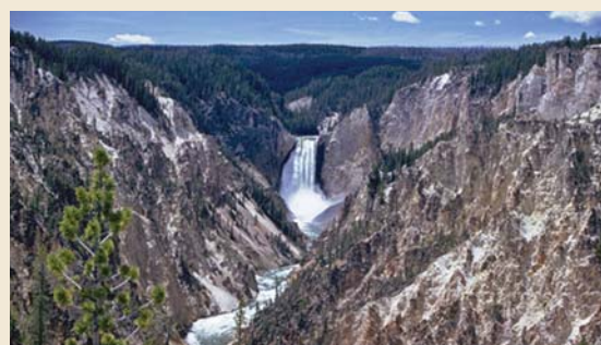
Yellowstone & Grand Teton National Parks

Established in 1971, the legend goes that the original site, atop a butte in the foothills of the South Mountains was a hideout for cattle rustlers. Today, it is Arizona's legendary Cowboy Steakhouse. It is the home to Money, an Arizona Longhorn Steer with horns that span four feet from tip to tip. They boast of an indoor waterfall and their famous "Tin Slide." (Years ago the Rooste was a cabin, the slide was part of a clever escape plan from bounty hunters.) Enjoy a Country Western BBQ dinner with garden greens and vegetables with house dressing, Arizona style ranch cowboy beans, western vegetable medley, tender corn on the cob, fresh baked biscuits and Indian fry bread with butter and honey, coffee tea and dessert. You won't want to miss this panoramic view of the city!