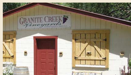
Granite Creek Winery & Prescott Tour

As Arizona's original territorial Capital, Prescott holds a wealth of history and culture preserved from its earlier territorial days. Let's go back in time with arts and crafts from around the Southwest. Enjoy the day wandering through the many booths (over 100) on the beautiful Courthouse Plaza. Visitors can also enjoy browsing through boutiques, antique shops and strolling through galleries. Lunch is at the Golden Corral (included).