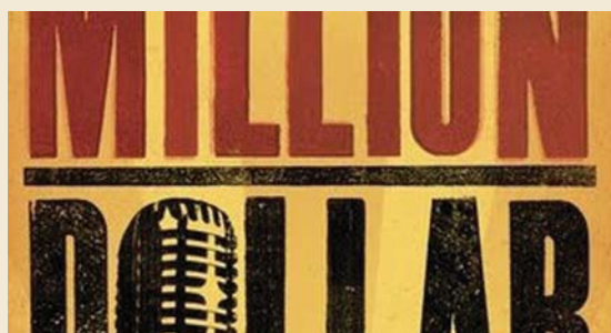
Million Dollar Quartet at Gammage

Enjoy this day in the high country! Learn about the legend of the Granite Dells located at Watson Lake. Ruins and artifacts indicate that Native Americans used to live here. While in Prescott, there will be time to tour attractions such as: Whiskey Row, the historic district, the neighborhoods with the beautiful restored Victorian homes and the historic hotels. The Hassayampa Inn has been voted the #1 Historic Hotel in Arizona, opening its doors in 1927 and not to forget the County Courthouse, where Rough Rider statue is located. From Prescott, we head to Chino Valley and the Granite Creek Winery where lunch and wine tasting will be served in the lush vineyards. A great time to beat the heat!