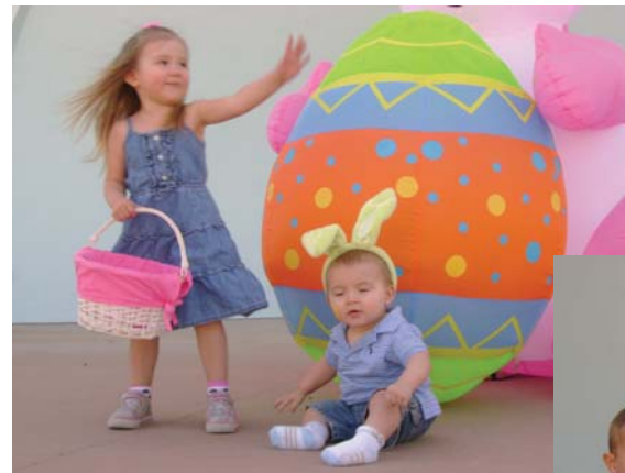
A pair of grandkids pose in front of the big blow-up bunny for family pictures.