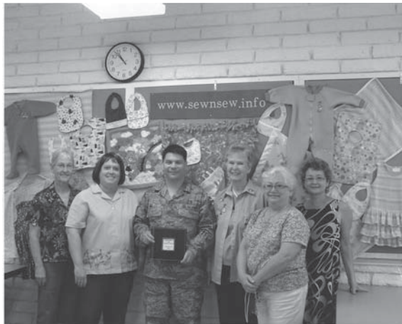
Sew 'N' Sew members have long supported Luke AFB's Airmen's Attic. This spring they received recognition for their efforts from First Lady Michelle Obama.

The club hosts an annual two-day "sew-in" event and last year's theme was "Blankets and Clothes for Infants," where Sew 'N' Sew members were joined by ladies from the Creative Quilters in sewing clothing and blankets for infants. At the sew-in, the ladies made 675 items, but ended the year 2011 having made more than 1,300 items. This year's Sew-In, which had a focus of newborn babies, yielded 317 completed items including