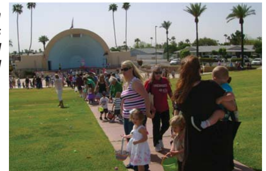
Sun City residents and their families swarmed the Sun Bowl April 6 for the egg hunt.

The annual event, held on Good Friday, is a fun time to bring your grandchildren and families to celebrate the Easter holiday! Thanks to all who came to the Sun Bowl April 6, you helped make it another wonderful community event!