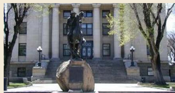
Prescott's Territorial Days Arts and Crafts Festival