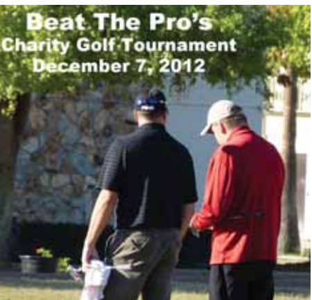
Beat The Pro's Charity Golf Tournament December 7, 2012