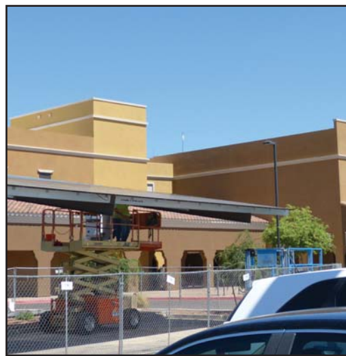
Fairway Solar Installation