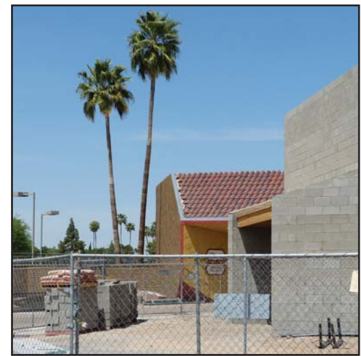
Bell Wood and Metal Shop Expansion