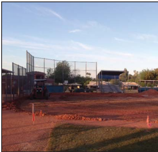
Sun Bowl Ball Field Renovations

Sign up for RCSC News Alert Emails at www.sunaz.com for the latest updates.