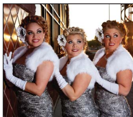
Uptown Angels Sunday, June 17

Free to all RCSC Cardholders & their guests * All Shows Begin at 7pm