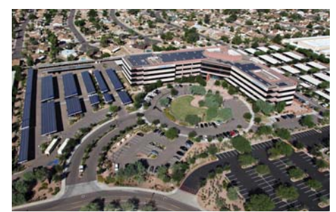
An example of what RCSC's new solar electric systems will look like.

Because RCSC is a non-profit organization it is not eligible for the federal tax see SOLAR on Page 2