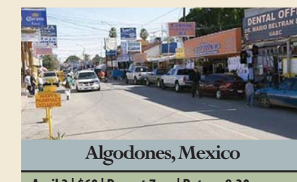
April 3 | $60 | Depart 7am | Return 8:30pm

Do you scrapbook? Make cards? Create home décor items? Join us at the Mesa Convention Center for the Creating Keepsakes Convention. You'll have the opportunity to shop at exhibitors' booths such as IT!, The Button Farm, Lickety Split Scrapbooks, Keller's Creations, SEI, The Paper Loft, Craft Fantastic, Strictly Scrapbooking and many more. You'll find booths that carry the latest products as well as those with incredible deals. The Creating Keepsakes Convention - Mesa Vendor Faire is a one-stop shopping location that has scrap-bookers and paper crafters coming from all over the Valley to enjoy. The convention offers something for everyone, so grab a friend or two and join the fun! Lunch is on your own.