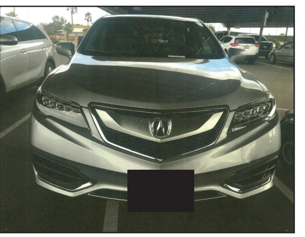
No matter what state you're from, while you're here in Sun City it is much appreciated if you would park in only one space (note the white line under car) and save these smaller spaces for qolf carts - as designed.

Please refer to the RCSC Cardholder Guide and Board Policies for more information regarding these matters. Your continued cooperation is appreciated!