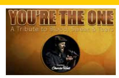
Blood, Sweat & Tears Tribute Wednesday, February 23, 2022