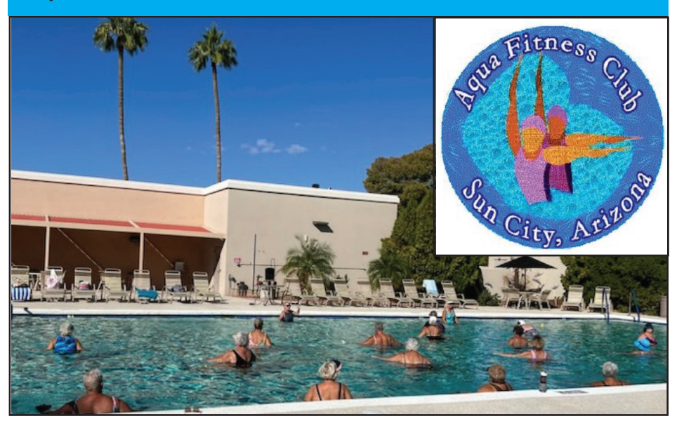
Need some exercise? Love the water? Ready to have a great time with new friends? Then Aqua Fitness is for you!

The club provides a gentler form of exercise using the pool. The routines are done in waist to chest deep water performed with music and verbal instruction. The 50-minute class includes stretching, aerobic and strengthening exercises. A stretch and tone class is available for those with limited mobility or who prefer non-aerobic type class.