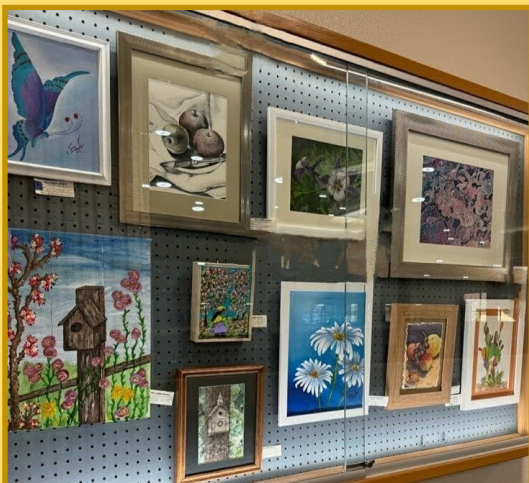
PVA Members ' Art

Artwork must be framed and ready for hanging. Smaller sizes, such as 8 x 10, 11 x 14 are preferred.