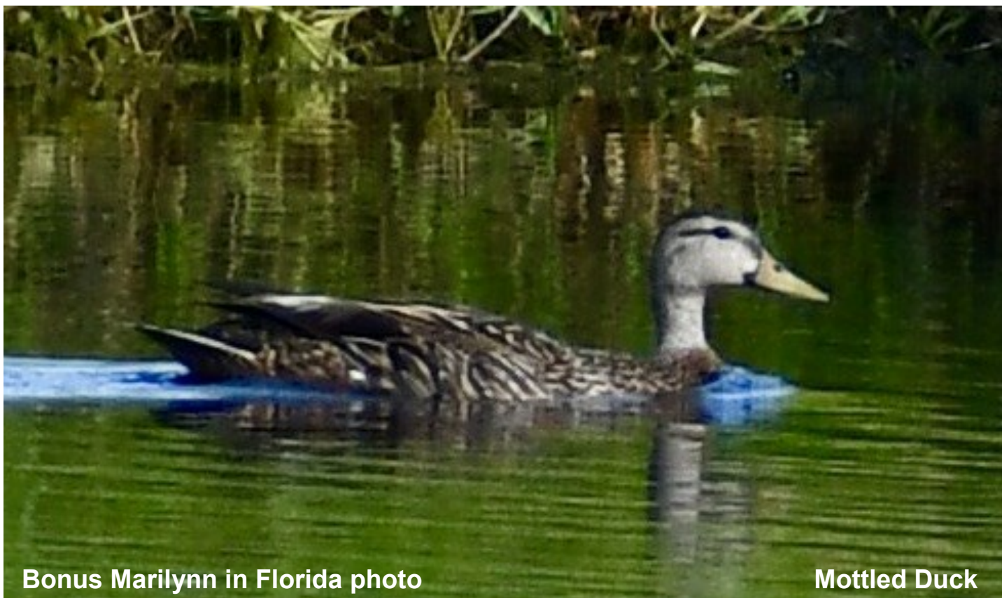
Bonus Marilyn in Florida photo