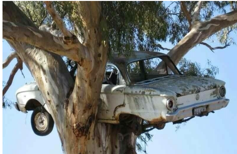
Above: it's no Millennium Falcon!