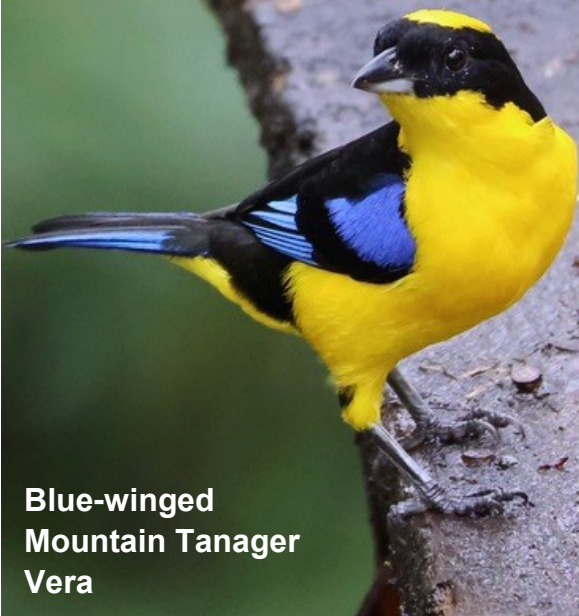
Blue-winged Mountain Tanager Vera