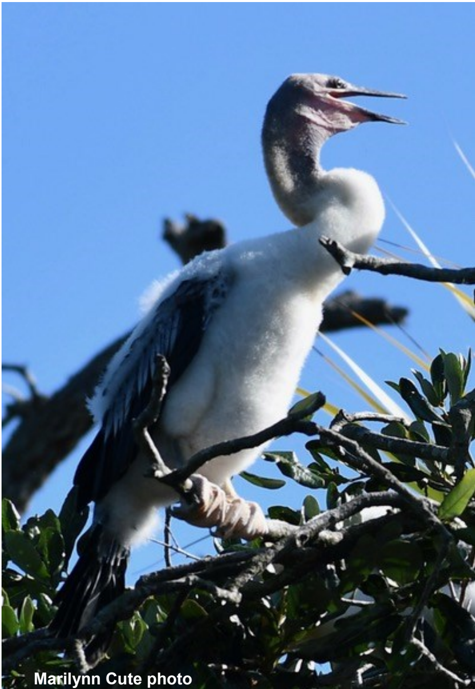
Marilynn Cute photo