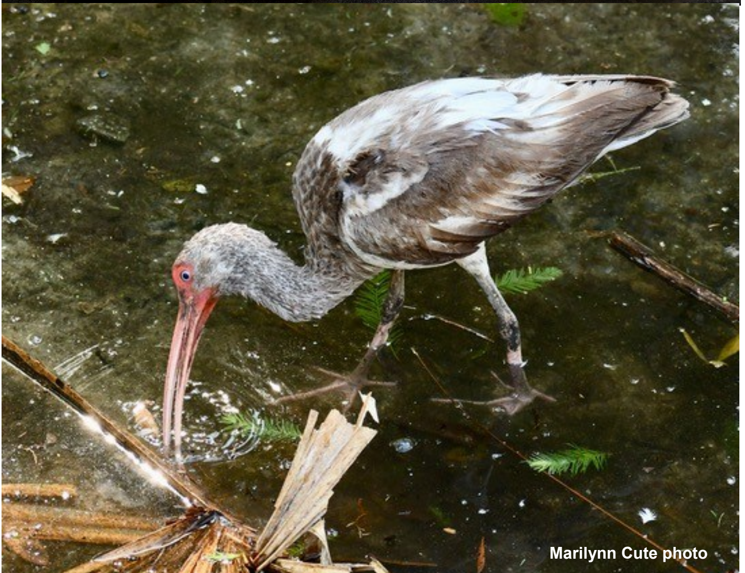
Marilynn Cute photo