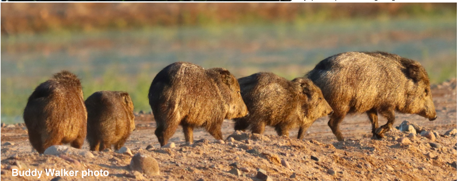
Buddy Walker photo

Below: As a segue to the following page, enjoy Buddy's recent sighting at the Ponds.