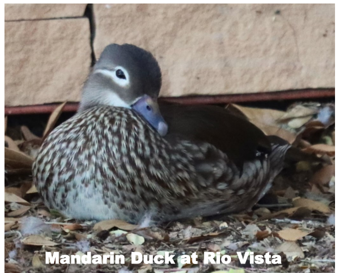
Mandarin Duck at Rio Vista

Waffling on the female Mandarin/Wood Duck conundrum has again put President Tom in hot water with eBird list oversight folks. I think I will be more sure next time.