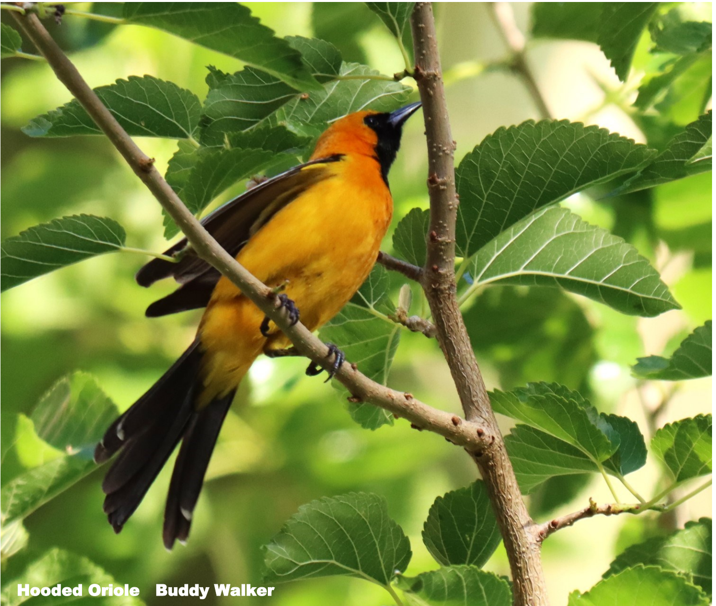
Hooded Oriole Buddy Walker

I will send you directions for highway or (streets) if you request them when you sign up.