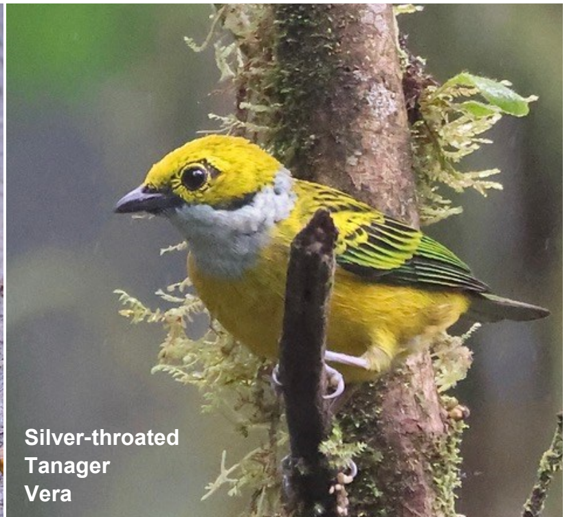
Silver-throated Tanager Vera