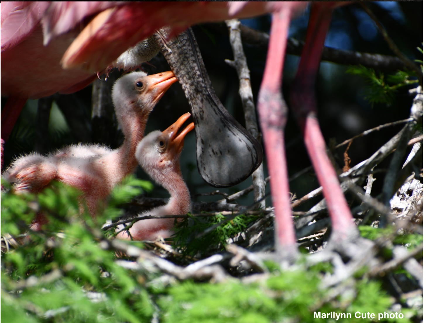
Marilynn Cute photo