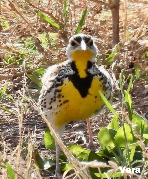
A Western Meadowlark saw us out.