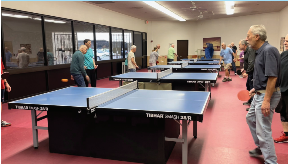
Table tennis, also known as ping-pong, dates back to the late 1800's Victorian England. It began as an after-dinner parlor game among the upper-class, and evolved into a highly organized competitive sport, especially in Europe and Asia. The first world championships were held in London in 1926, and the sport officially joined the Olympic Games in 1988. Many incredible games are available to watch on YouTube!

Better yet, many incredible (or at least fun) games are available at the SUN CITY TABLE TENNIS CLUB! The club is open to all RCSC cardholders, with $10 annual dues. Coaching is available for new members, and a top-of-the-line robot is available for practice and training as well. Loaner paddles can be provided, though most players have their own (the club can provide guidance for paddle selection / purchase).