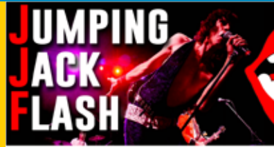
JUMPING JACK FLASH Rolling Stones Tribute Wednesday, September 15 Show: 7pm; Doors Open 6pm