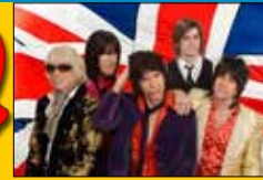
We've invited Mick & his chums back to Sun City AZ for this spot-on Rolling Stones tribute band - Jumping Jack Flash. This is definitely a fan favorite & you'll be impressed by the moves & mannerisms in this superb performance that is sure to bring down the house!