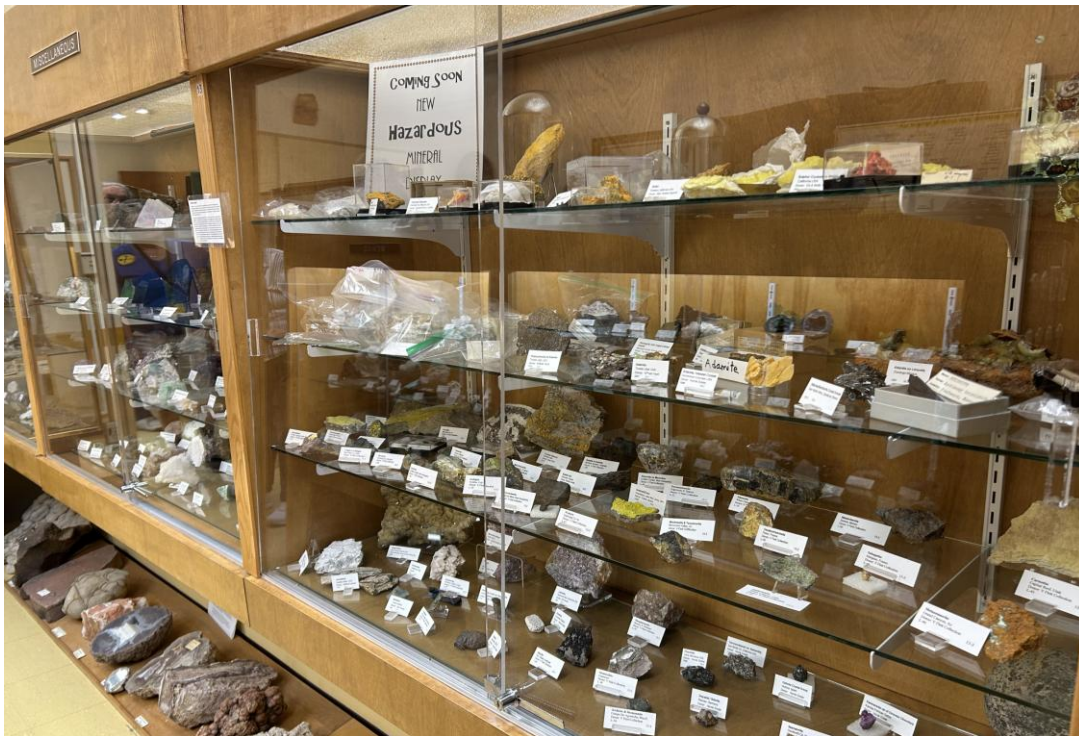
In progress, new hazardous mineral display