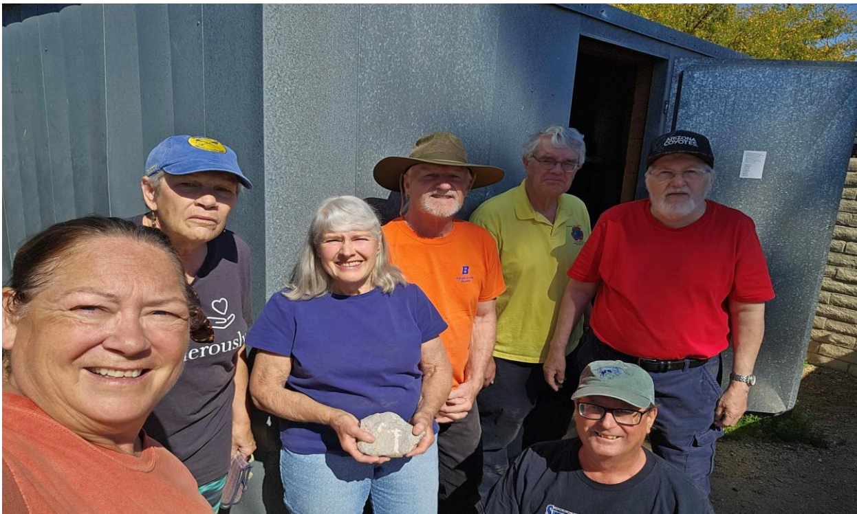
Volunteers cleaning out the Mt. View shed

With gratitude and appreciation, Cheryl Etten