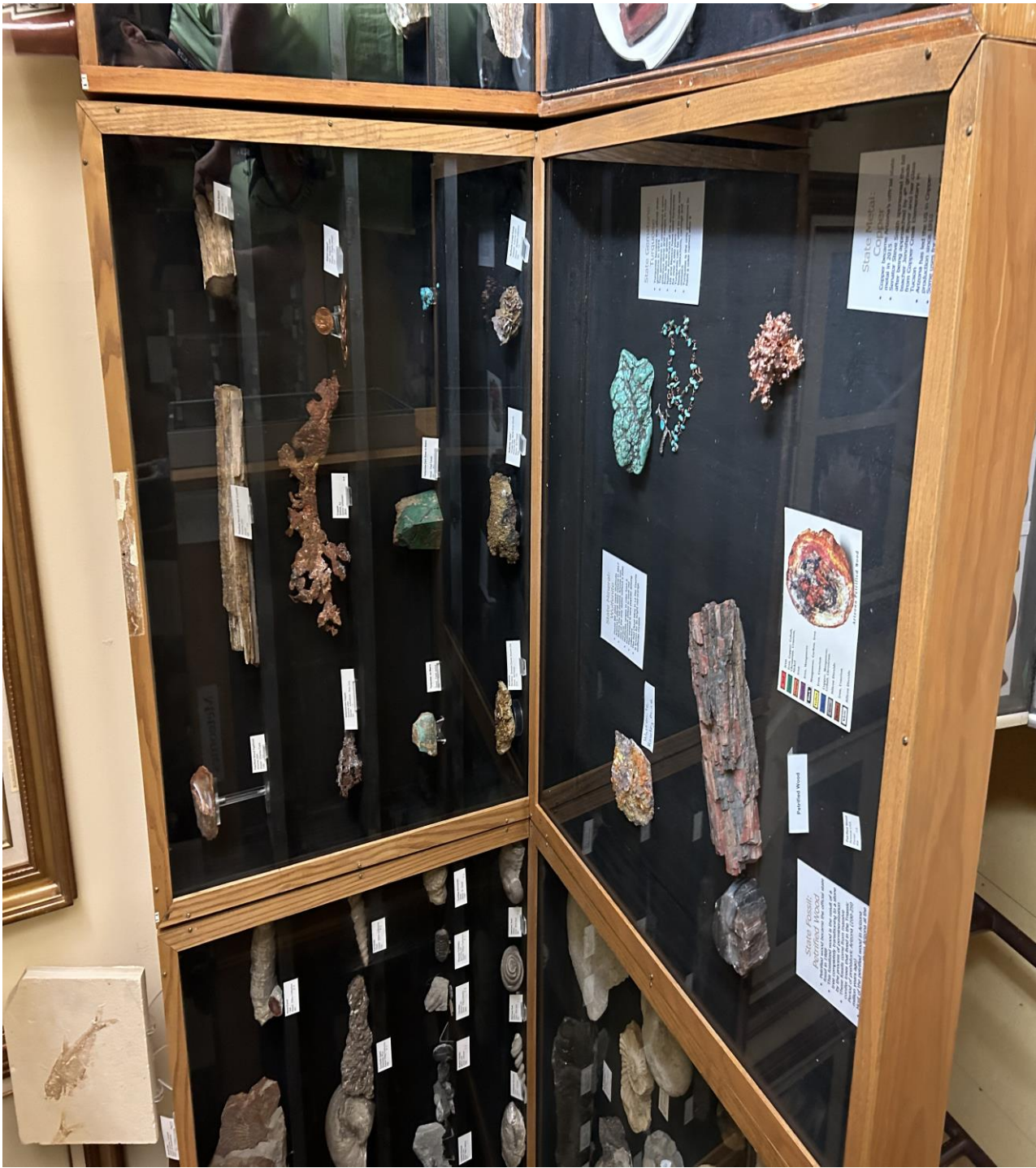
New Arizona State symbols display. Included are: turquoise, petrified wood, wulfenite, and copper