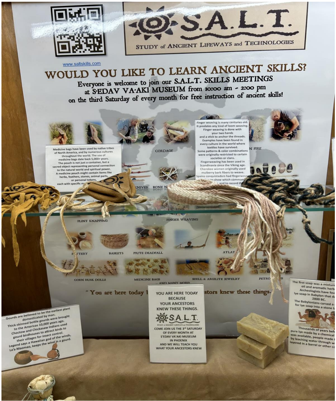
Parts of the new SALT, guest cabinet display